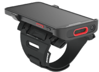
The CT37 Wearable solution for a hand-free

The CT37 is armed with the latest FlexRange FR bright green dot laser, which is more visible at long distance and under strong sunlight than devices configured with red dot laser. It brings long range scanning performance found in industrial devices to lightweight, pocketable devices like the CT37. The ultimate in flexibility, FlexRange enables virtually every scanning use case in a single, compact device without compromising range or speed, enabling businesses to focus on fewer device types to manage.