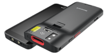
The CT37: 5G mobile computer on the Mobility Edge™ platform, elegant, slim, powerful, durable, and easy to use.

The CT37 also comes with the latest 5G and Wi-Fi 6E technology to stay connected in both indoor and outdoor environments. 5G offers the highest bandwidth and lowest latency available for frontline workers. Whether you are on a private 5G or CBRS network, or a Wi-Fi 6E environment, your networks can continue their workflows with reliable uptime.