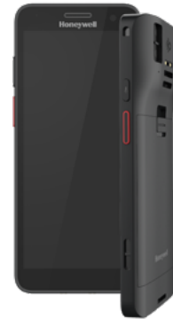
The CT37: 5G mobile computer on the Mobility Edge™ platform, elegant, slim, powerful, durable, and easy to use.

Reliable performance, data connectivity, and communications for frontline mobile workers, the CT37 is an all-purpose hand-held device tool to keep business workflows moving and operations flowing. Combined with powerful software including Operational Intelligence, Smart Talk communications, Smart Pay, and more, the CT37 is the ideal platform on which users in retail, healthcare and delivery can build effective solutions.