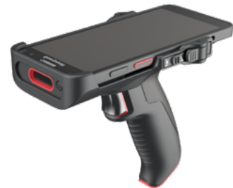
CT37 with Scan handle

The CT37 wearable solution is a purpose-built wearable accessory that provides highly efficient hands-free operations. The wearable solution is designed for maximum user comfort and easy swapping between workers. The CT37 device can also be easily removed from the wearable holder and used alone for in-store or other applications.